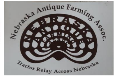
TRAN "tractor seat" magnet