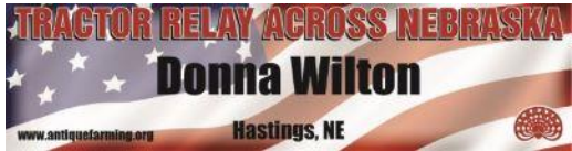
Personalized magnet (no year, includes website)