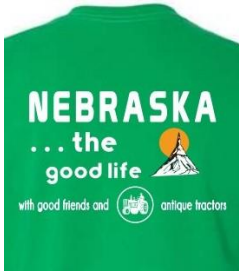
Back of T-shirt