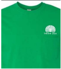
Front of T-shirt

Merchandise must be ordered prior to May 1, 2024. Merchandise can be picked up the first day of drive.