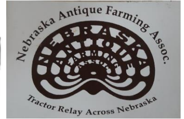
TRAN "tractor seat" magnet