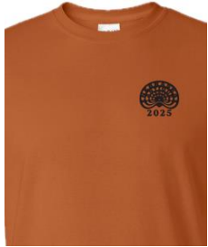
Front of T-shirt

Merchandise must be ordered prior to May 1, 2025. Merchandise can be picked up the first day of drive.