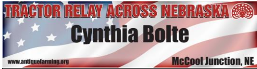
Personalized magnet (no year, includes website)