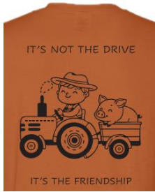
Back of T-shirt